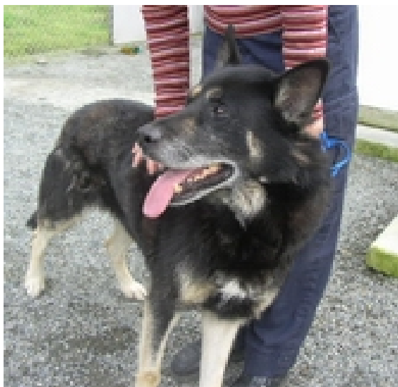
Max: Had severe ear infections