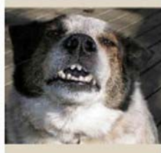
Everyone Smiles In The Same Language