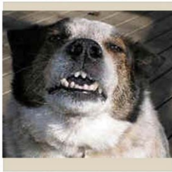
Everyone Smiles In The Same Language