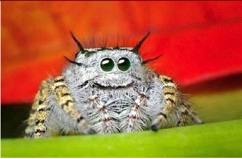
That spikey hairdo really brings out your eyes!!