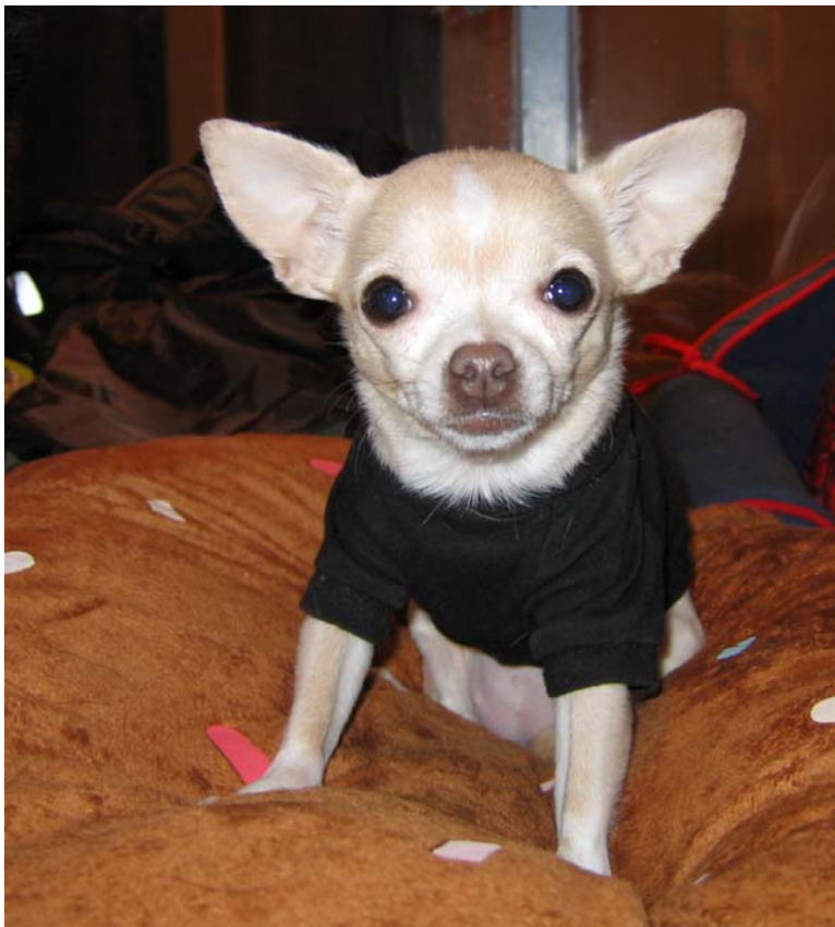
Simmah on her "Pup"cake bed