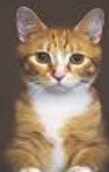
100% of Proceeds go to Save Animals Just Like These