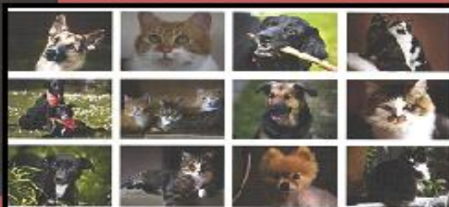
All animals in this calendar have been rescued by Animal Crusaders